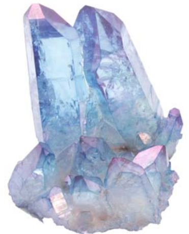
Tanzine Aura Quartz

The word "stone" is a slang word that can mean a rock or a mineral specimen that is not a crystal.